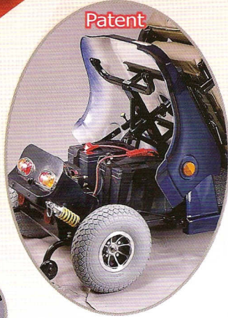
● Lifting rear cover for quick maintenance