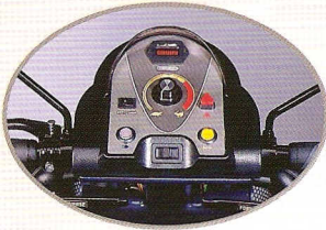
● User-friendly control panel