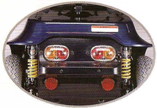
● Front and rear double suspension