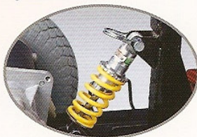
● Enhanced rear suspension