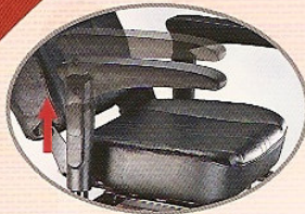
● Adjustable armrest height