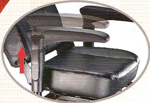
● Adjustable armrest height