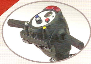
● Streamlined control panel design