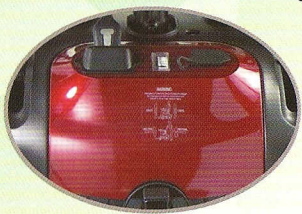
● Integrated front console