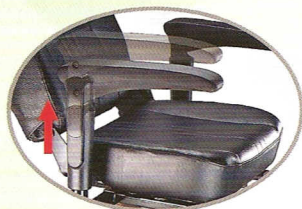
● Adjustable armrest height