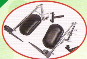
● Elevating Leg Rests